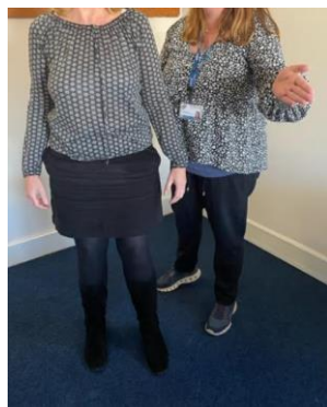
Reference: Prompting 2