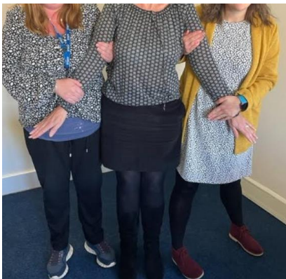
Reference: Straight arm immobilisation 6