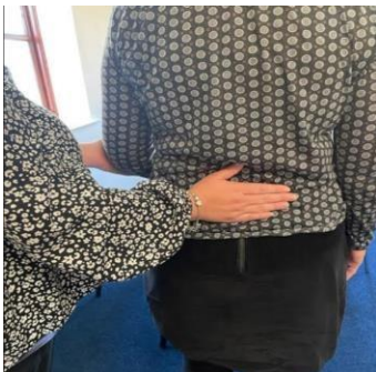
Reference: Guiding 3