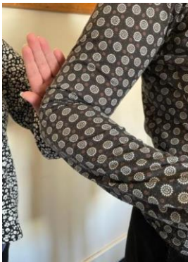
Reference: Prompting 1