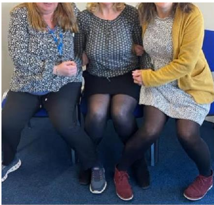
Reference: Seated kicking position 8