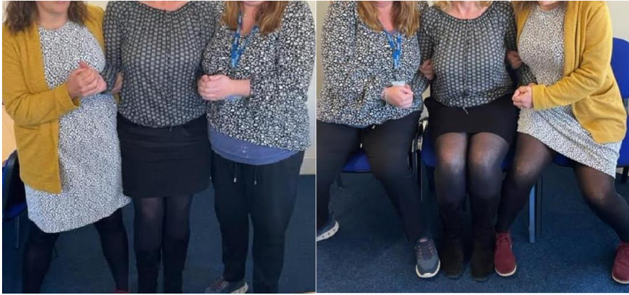
Reference: Seated rest position 7