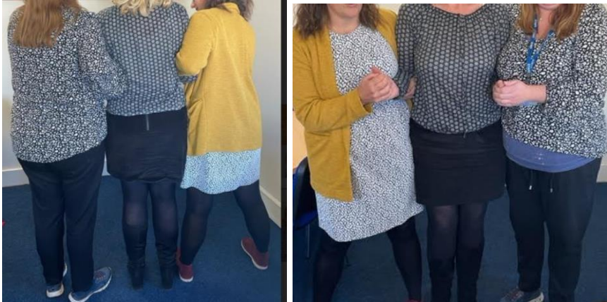
Reference: Double cup hold 5