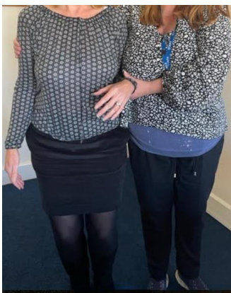
Reference: Escort 4